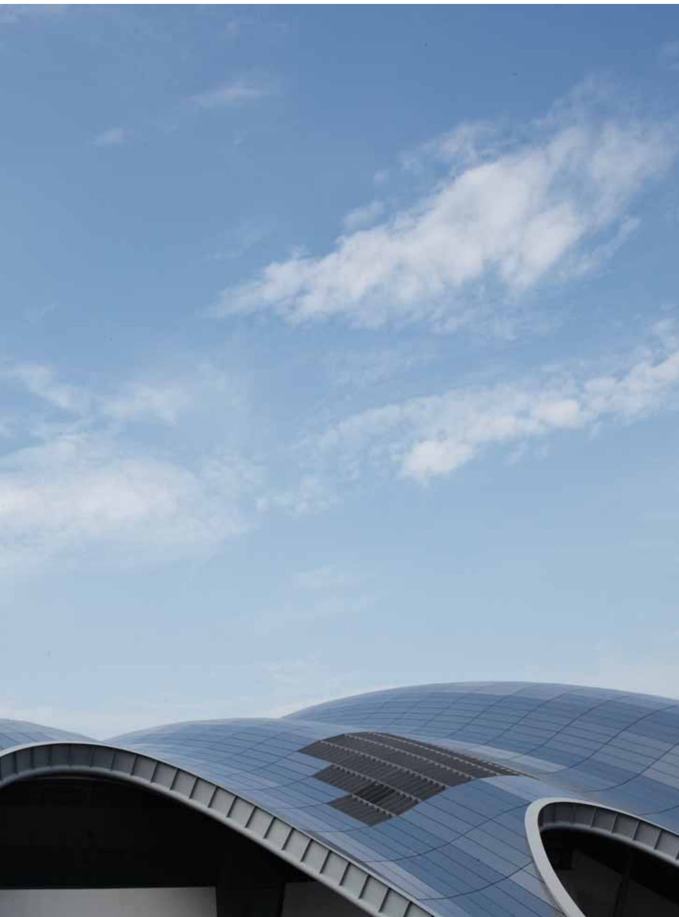
The Sage Gateshead, Gateshead