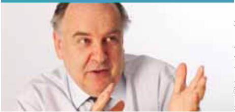
Lord Charles Falconer Chair, 1NG